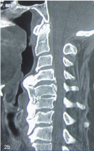
[Table/Fig-2a,b]: (a) An X-ray showing giant cervical osteophyte anterior to C4 and C5 vertebral bodies along with feature suggestive of DISH. (b) CT scan showed ossification of anterior longitudinal ligament from C4 to C7.