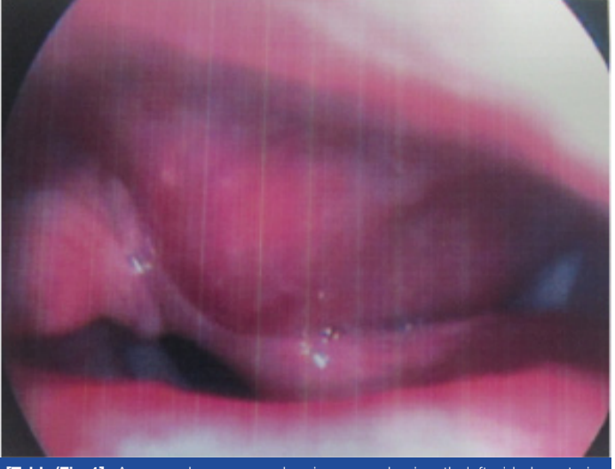
[Table/Fig-1]: An oesophagoscopy showing a predominantly left sided posterior pharyngeal wall mass, causing narrowing of the pharyngeal lumen.

Dysphagia due to skeletal causes is a rare entity. A large cervical osteophyte can cause mechanical compression of the pharyngo-oesophageal segment leading to dysphagia. Large cervical